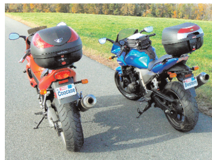
The fancy CooCase V36 on the left and the budget Bestem T-Box 2008 on the right.

The CooCase mounts directly to many OEM and aftermarket racks using the