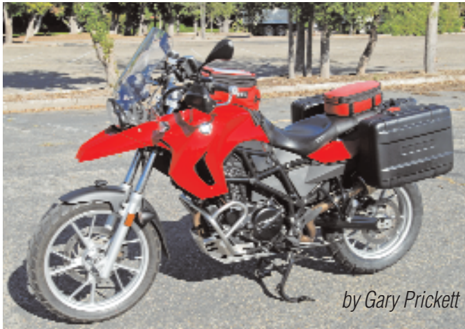
by Gary Prickett

THE WORD “FARKLE” has entered the motorcyclist’s lexicon of familiar terms. Although the origin of the word and its meaning are the stuff of urban legend, a logical suggestion is that it’s a contraction of “function” and “sparkle.” Thus, the commonly accepted meaning is: An accessory item that enhances not only the functionality of a motorcycle, but also its appearance. It has also been postulated that the word farkle is an acronym for Fancy Accessory Really Kool Likely Expensive. Other forms of the word have also been established, such as Farklitis: The irrepressible urge to buy new accessories, and continuing to purchase them even as their functionality becomes less and less.