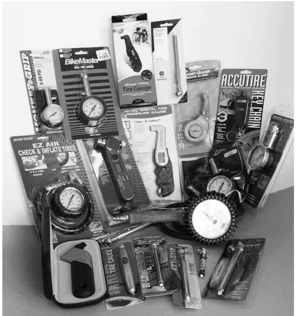
We tested 22 gauges, from a couple of no-name toolbox finds to the very latest digital audio-visual types.

Those who race bikes and prepare bikes for others to race are fanatical about tire pressure. We visited AJ Ammann who operates AJ's Performance in Phoenix. In addition to doing high performance work