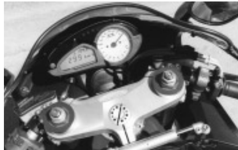
Above: The shape of the elegant instrument console is repeated in the hydraulic reservoirs on either side. Note the little serial number plaque: "N 007/300."