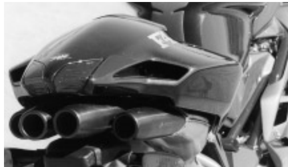
Above: The gorgeous "organ pipe" exhaust is another signature feature. Our bike had the less-restrictive set fitted. These pipes don't cost extra, but come included, along with a remapped ignition chip. They sound incredible at 13,900 rpm!