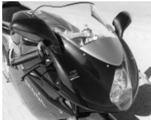
Left: Up close, you can see how streamlined the gently rounded nose of the bike is, and also the metallic flecks in its charcoal grey paint. Its stacked polyellipsoidal headlights were originally controversial, but now, we couldn't imagine anything else looking so right. Note the turnsignals, tastefully integrated into the mirrors.