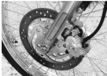
Above: New brakes distinguish the 2004 Sportsters. Made by Nissin, the two-piston front and single piston rear stoppers replace the four-piston units used previously. They look better, but didn't stop as quickly.