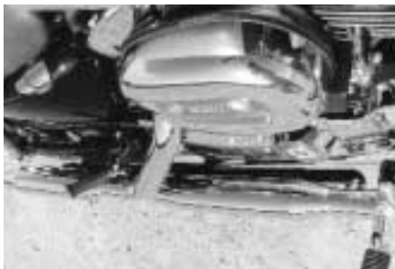
Below: See the black exhaust crossover pipe behind the mufflers, allowing an unobstructed view of the cylinders, but cornering clearance suffers badly.