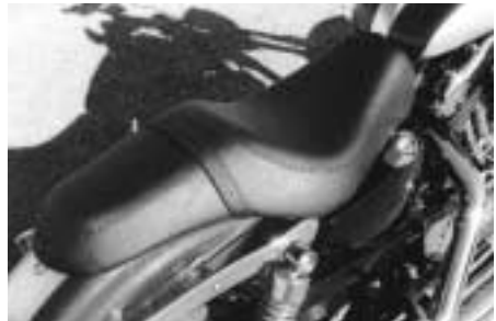
Left: The new pop-up oil filler no longer fouls the rider's leg. But the seat isn't as clever. Its scoop shape feels like a wedge after 50 miles and the pillow portion is narrow and slopes backward—poor.