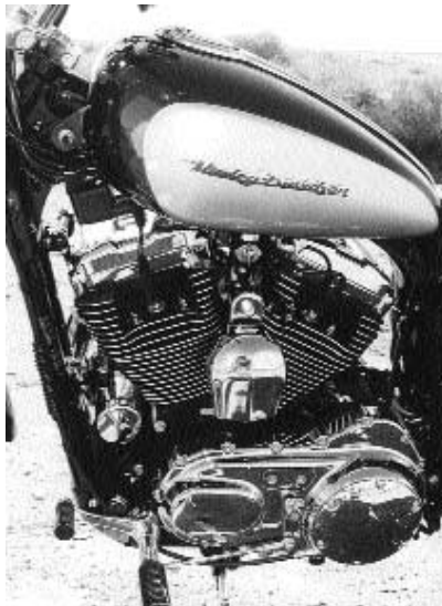
Above: With bigger finning and a new primary cover, the 1200 is similar to Buell's XB12 design, but in polished chrome, you don't recognize it. The new 4.5 gal. gastank is very pretty in two-tone paint.